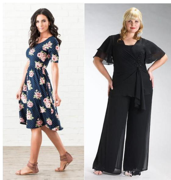
Two conscious efforts at self-respect and femininity. Godly doesn't equal ugly! And feminine doesn't necessarily equal dresses.

Those who seek to obey God's command in this verse interpret it in various ways. For some reason, some of those seeking to obey God in this verse feel that they must therefore dress ugly, or that they must insist that their women wear only dresses and/or skirts!