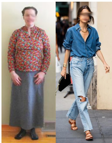
Two conscious efforts at looking ugly and/or masculine! Is this glorifying to God??

- Some do their best to obey it; some disobey it altogether, given the modern tendencies to both unisex and ignoring of Scripture and righteousness.